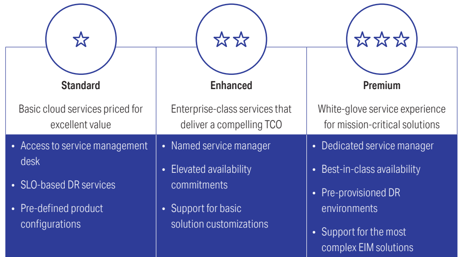
Figure 3: OpenText provides three pre-defined service tiers. Each tier defines key performance indicators.